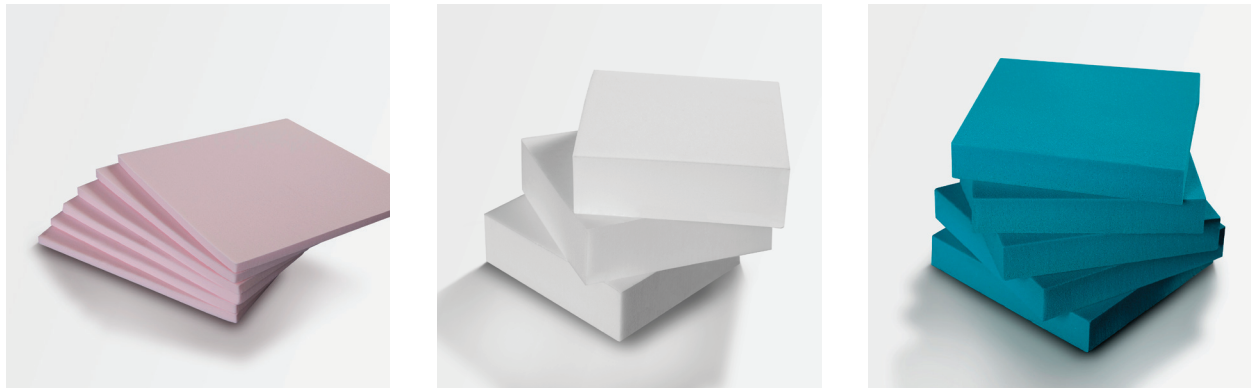
Table 2: Typical absorption and physical characteristics of silver antimicrobial foam