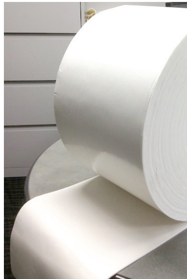
A master roll of silver antimicrobial foam with a carrier paper 4.5mm thickness x 381mm width x 45.72m length

In a recent study, the objective was to design and develop a biocompatible, super soft, high absorbent/retention wound dressing material consisting of polymer stabilized nanosilver and one or a combination of PHMB and CHG for exudate management, while at the same time maintaining antimicrobial efficacy of greater than 4-log reduction (>99.99%) against Gram-positive and Gram-negative bacteria species for an immediate and extended period of time.